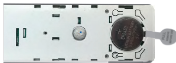
Figure 2: Remote with battery cover removed